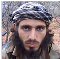
The Jihadist Next Door