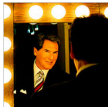
The Importance of Being