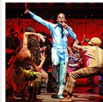
Feeling Unsettled at a